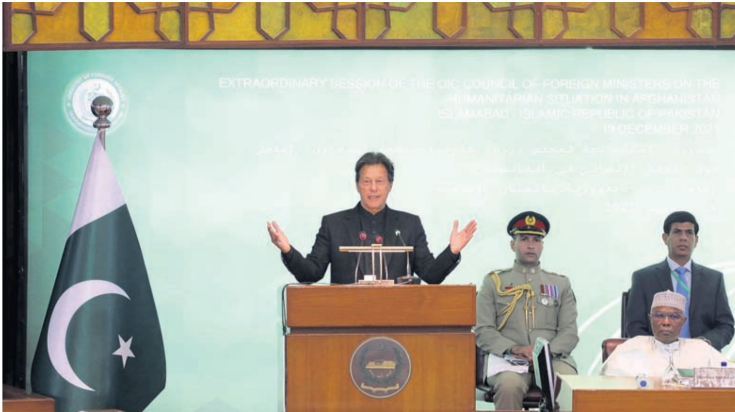
Pakistan Prime Minister Imran Khan, center, speaks during the 17th extraordinary session of Organization of Islamic Cooperation (OIC) Council of Foreign Ministers, in Islamabad, Pakistan, Sunday, Dec. 19, 2021.